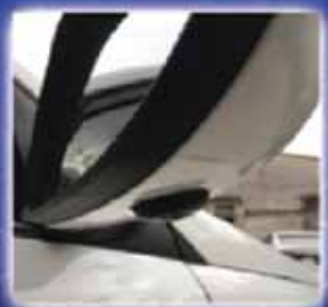
RIGHT SIDE CAMERA