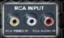
RCA INPUT RCA VIDEO IN RCA AUDIO IN AV 2 INPUT