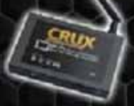
AV 1 INPUT Smartphone Mirroring