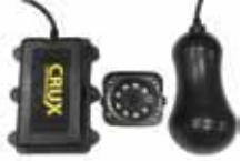
CTR-01Q Wireless Truck Camera