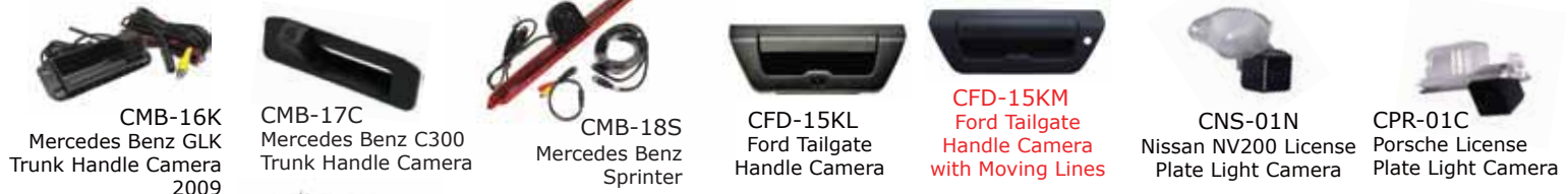
CMB-16K Mercedes Benz GLK Trunk Handle Camera 2009 CMB-17C Mercedes Benz C300 Trunk Handle Camera CMB-18S Mercedes Benz Sprinter CFD-15KL Ford Tailgate Handle Camera CFD-15KM Ford Tailgate Handle Camera with Moving Lines CNS-01N Nissan NV200 License Plate Light Camera CPR-01C Porsche License Plate Light Camera