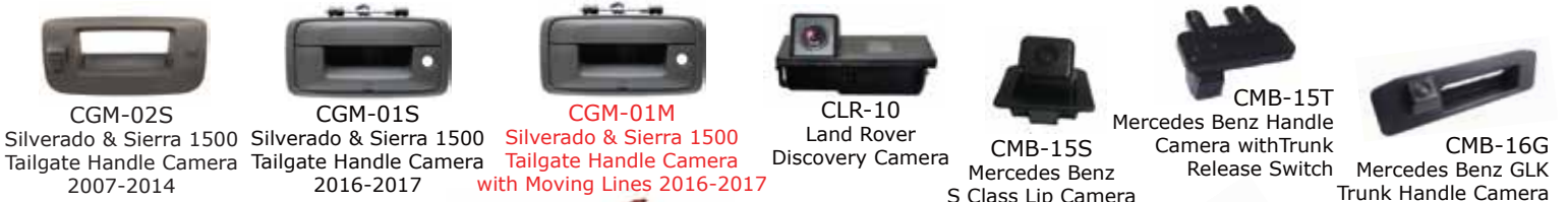
CGM-02S Silverado & Sierra 1500 Tailgate Handle Camera 2007-2014 CGM-01S Silverado & Sierra 1500 Tailgate Handle Camera 2016-2017 CGM-01M Silverado & Sierra 1500 Tailgate Handle Camera with Moving Lines 2016-2017 CLR-10 Land Rover Discovery Camera CMB-15S Mercedes Benz S Class Lip Camera CMB-15T Mercedes Benz Handle Camera with Trunk Release Switch CMB-16G Mercedes Benz GLK Trunk Handle Camera