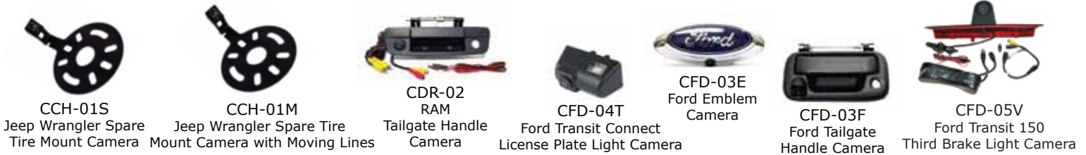
CCH-01S Jeep Wrangler Spare Tire Mount Camera CCH-01M Jeep Wrangler Spare Tire Mount Camera with Moving Lines CDR-02 RAM Tailgate Handle Camera CFD-04T Ford Transit Connect License Plate Light Camera CFD-03E Ford Emblem Camera CFD-03F Ford Tailgate Handle Camera CFD-05V Ford Transit 150 Third Brake Light Camera