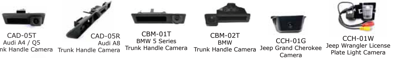
CAD-05T Audi A4 / Q5 Trunk Handle Camera CAD-05R Audi A8 Trunk Handle Camera CBM-01T BMW 5 Series Trunk Handle Camera CBM-02T BMW Trunk Handle Camera CCH-01G Jeep Grand Cherokee Camera CCH-01W Jeep Wrangler License Plate Light Camera