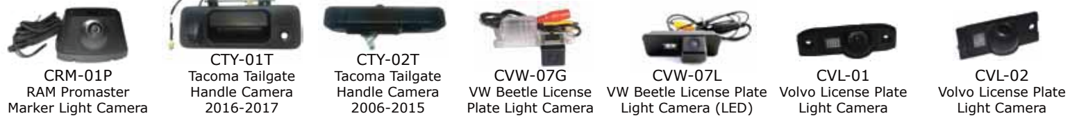
CRM-01P RAM Promaster Marker Light Camera CTY-01T Tacoma Tailgate Handle Camera 2016-2017 CTY-02T Tacoma Tailgate Handle Camera 2006-2015 CVW-07G VW Beetle License Plate Light Camera CVW-07L VW Beetle License Plate Light Camera (LED) CVL-01 Volvo License Plate Light Camera CVL-02 Volvo License Plate Light Camera