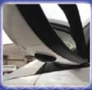
LEFT SIDE CAMERA