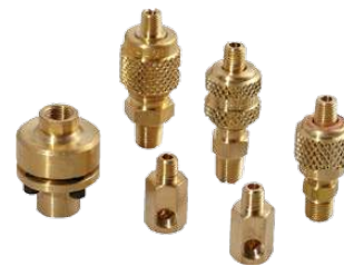
VPASU ANTI-SIPHON VALVE KIT 1/4" SAE, 3/8" SAE, 1/2"-20 UNF female knurl nut