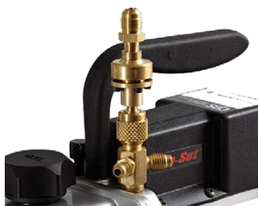
VPAS4 ANTI-SIPHON VALVE KIT 1/4" SAE female knurl nut