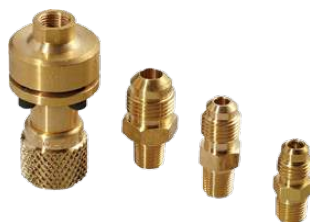
VPAS8 ANTI-SIPHON VALVE KIT 3/8" SAE female knurl nut