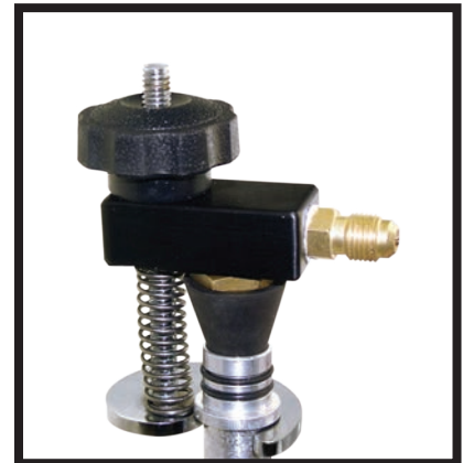
#6 Universal couplers