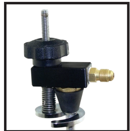
#12 Universal couplers