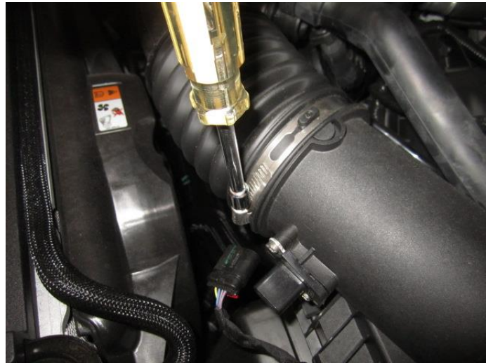
8. Loosen the clamp holding the factory air duct to the air box.