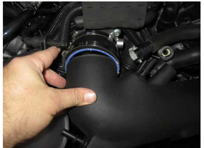
20. Press the CORSA air duct into the 3.5in sleeve.