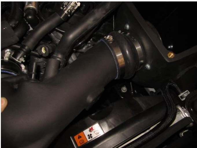
19. Press the CORSA air duct into the 4in hump hose, do not tighten the clamp at this time.