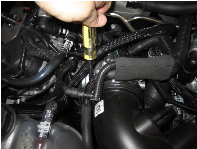
7. Loosen the clamp holding the factory air duct to the throttle body.