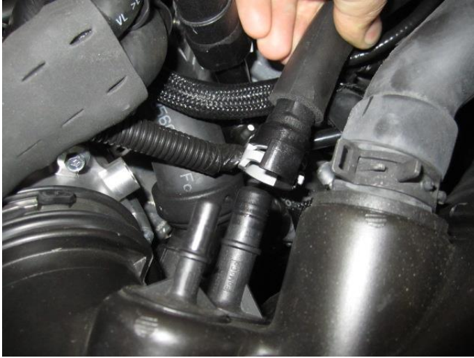
5. Disconnect the crankcase vent hose from the factory air duct.