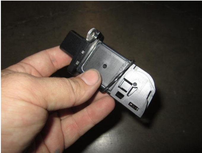
17. Remove the O-ring from the MAF sensor.