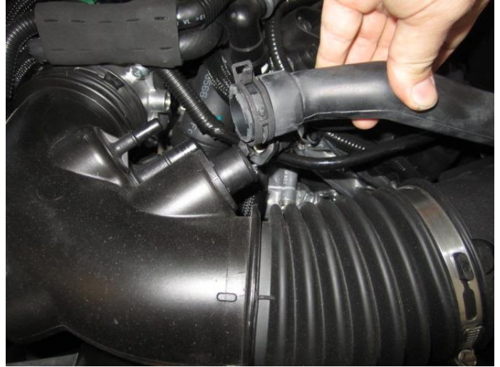
6. Disconnect the sound tube from the factory air duct.