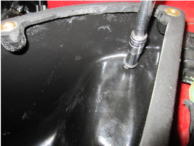
9. Tighten the CORSA box in place using the factory 10mm bolt.