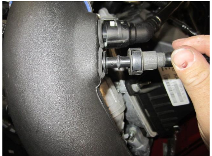
16. Press the factory breather lines onto the CORSA snap fittings.