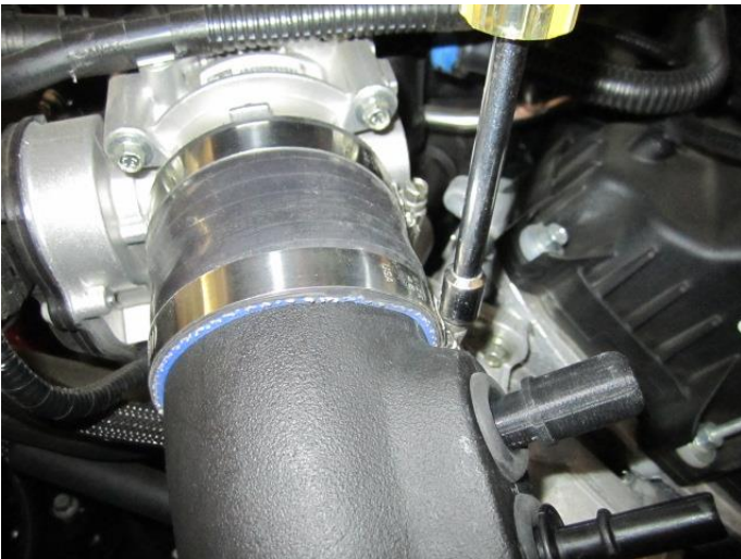
15. Tighten the clamp holding the duct to the 3in sleeve using a 5/16 socket or nut driver only.