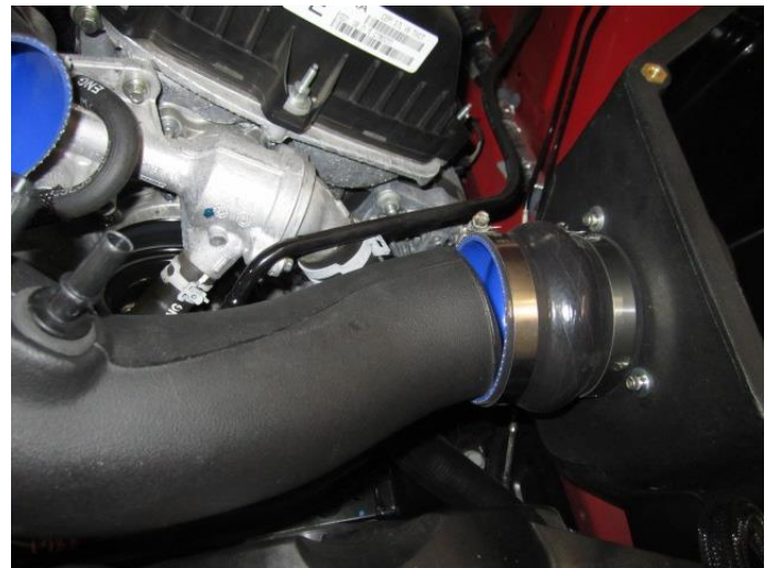
12. Slide the CORSA duct into the hump hose, do not tighten the clamp at this time