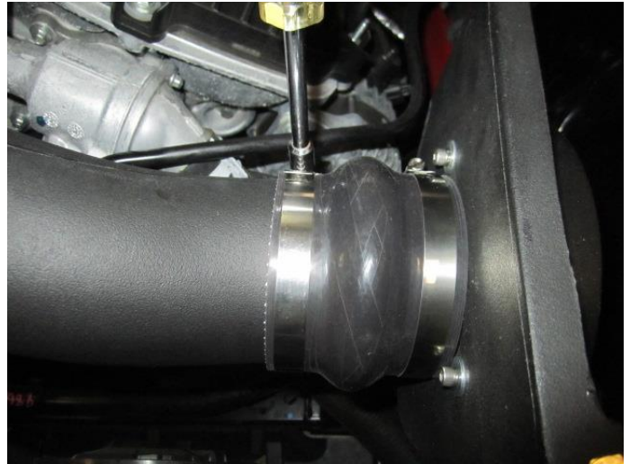
14. Tighten the clamp holding the duct to the hump hose using a 5/16 socket or nut driver only.