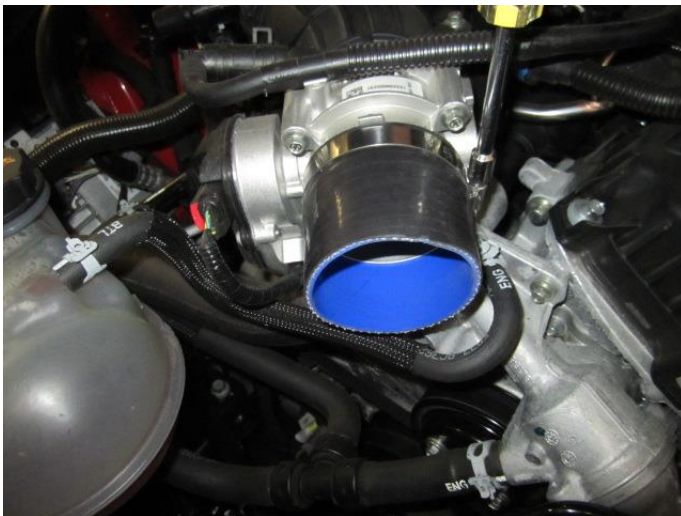
11. Tighten the 3 x 3.25 sleeve to the throttle body using a 5/16 socket or nut driver only.