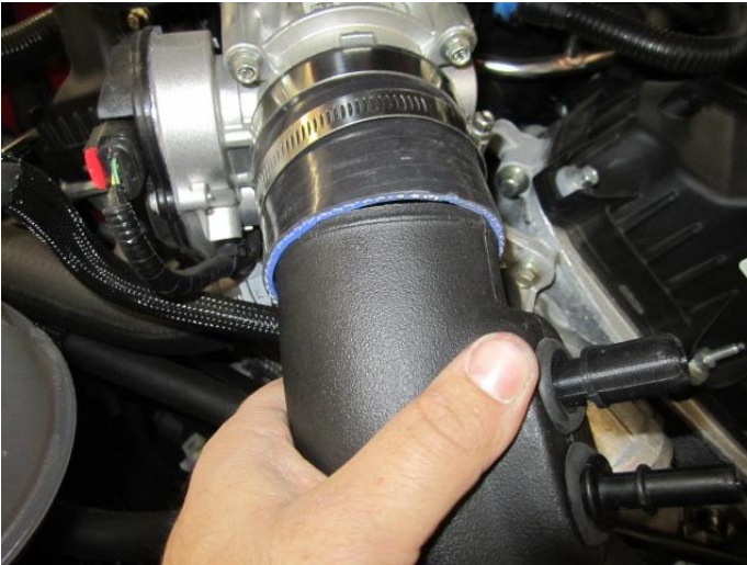
13. Slide the CORSA duct into the 3in sleeve, do not tighten the clamp at this time.