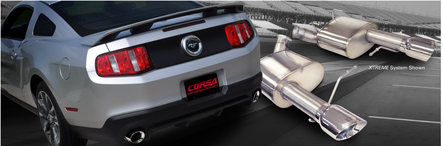
XTREME System Shown