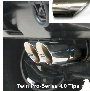
Twin Pro-Series 4.0 Tips