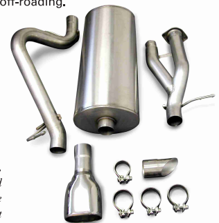
H2 exhaust system shown with wide Mouth tip.

The precision engineering, uncompromising quality and flawless fit and finish of the CORSA Performance Exhaust is guaranteed for as long as you own your HUMMER H2.