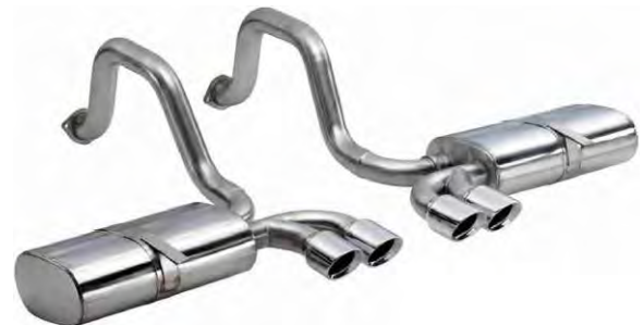
Pro-Series 3.5 Tips