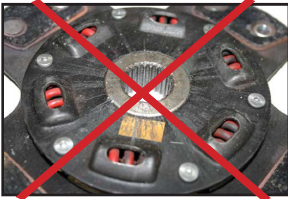
Example of TOO MUCH GREASE, which causes grease to spray all over the disc and ruin the disc material or pads.

If your disc looks like this after installation any and all warranties will be VOID.