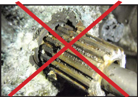
Example of TOO MUCH GREASE on input shaft, which causes grease to spray all over the disc and ruin the disc material or pads.