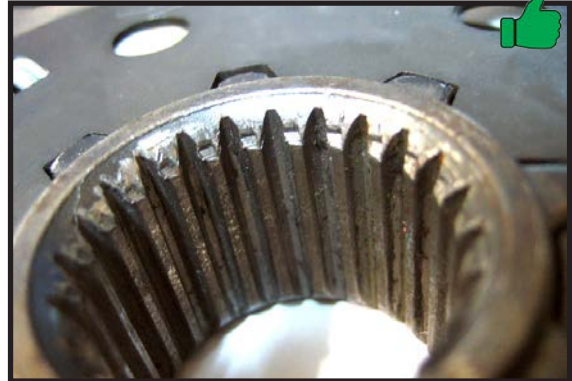
Example of PERFECT AMOUNT OF GREASE. As you can see it is barely visible to the naked eye and acts as more of a lubricant.