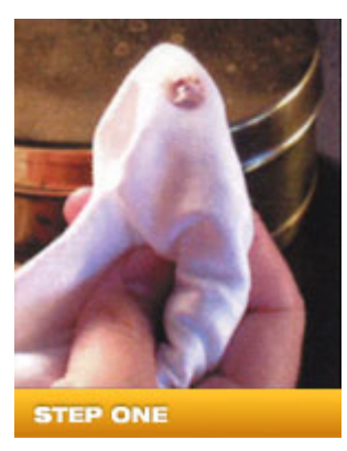
Apply a little Simichrome to a Rub gently in a circular clean soft cloth. Rub gently in a circular motion on surface to be