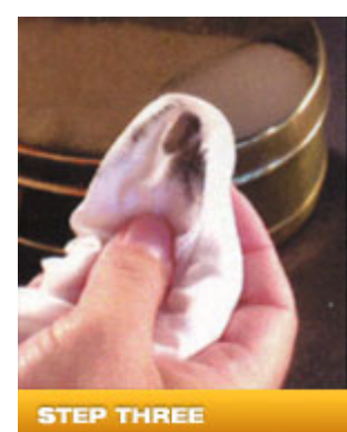
Wipe away the grime and polish.