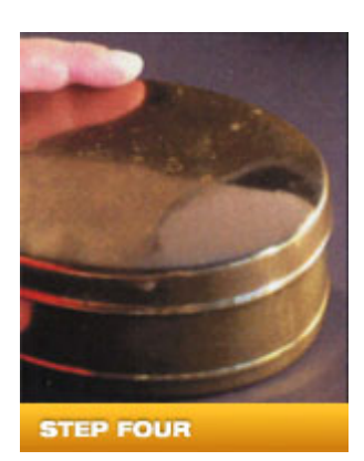
Buff with a clean, soft cloth and you're finished!