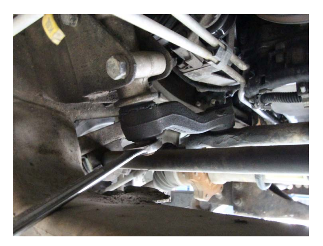
Figure 3: idler arm