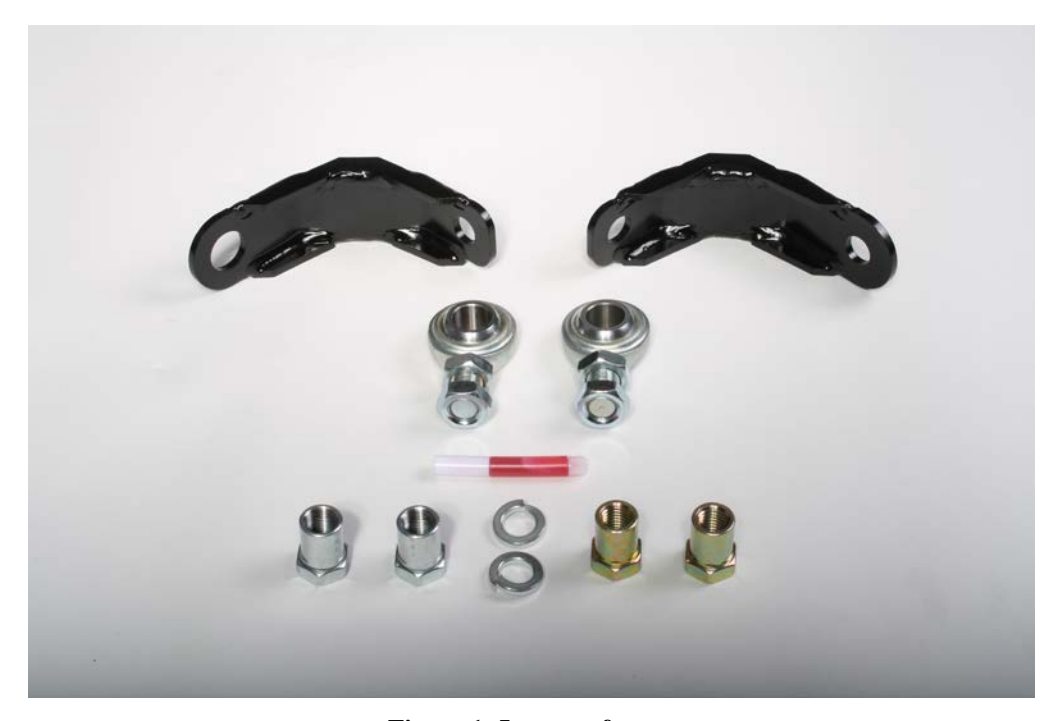
Figure 1: Layout of parts