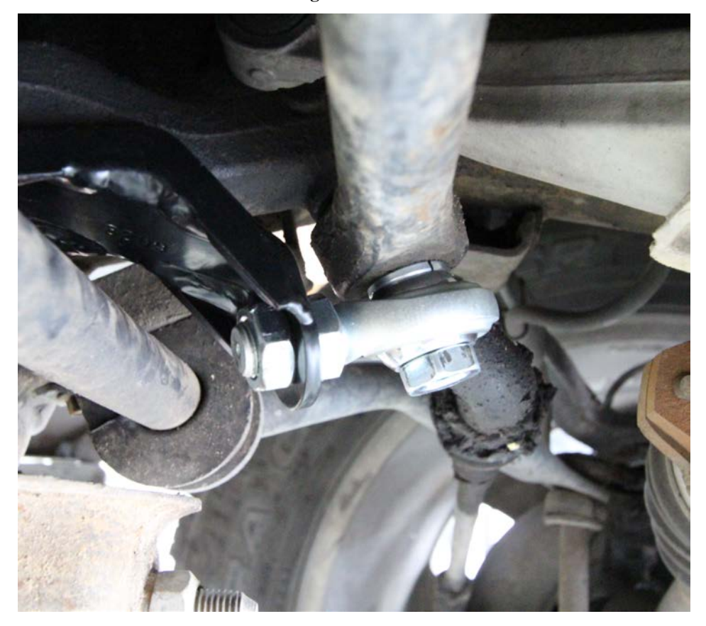
Figure 4: idler arm bracket installed