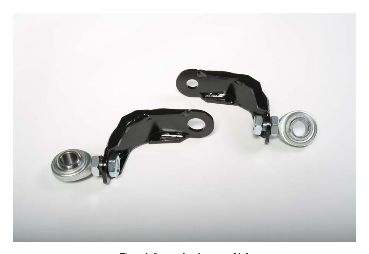
Figure 2: Support brackets assembled