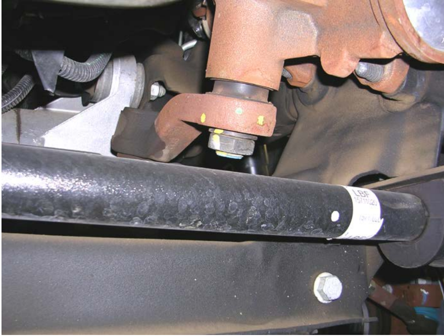
Figure 4: pitman arm