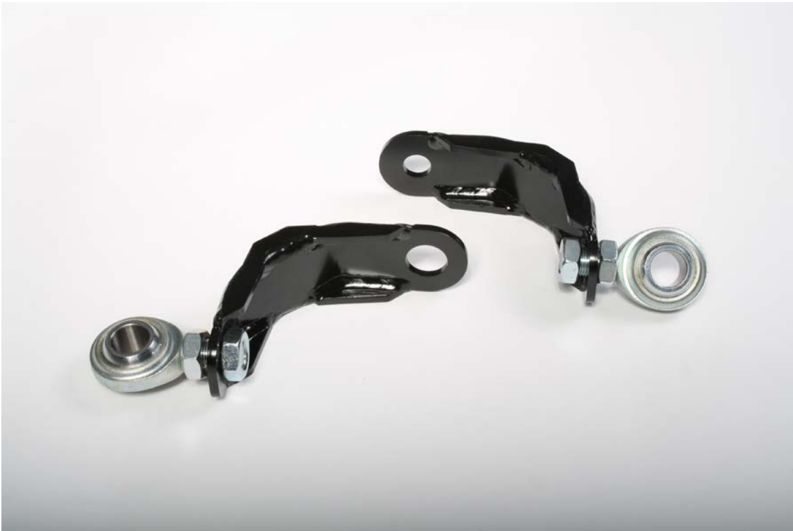
Figure 1: Pitman arm bracket on left, Idler arm bracket on right