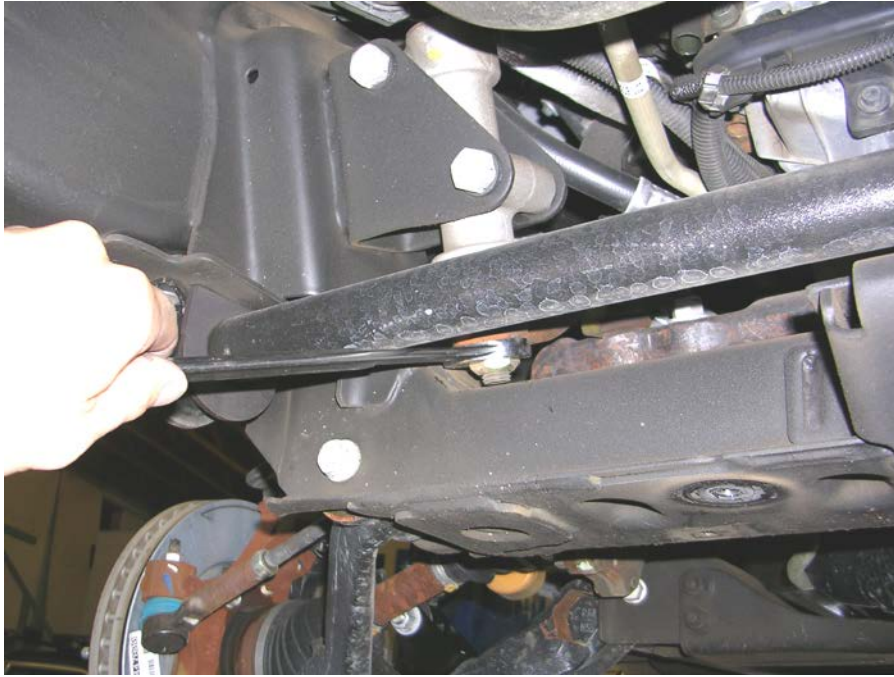
Figure 2: idler arm