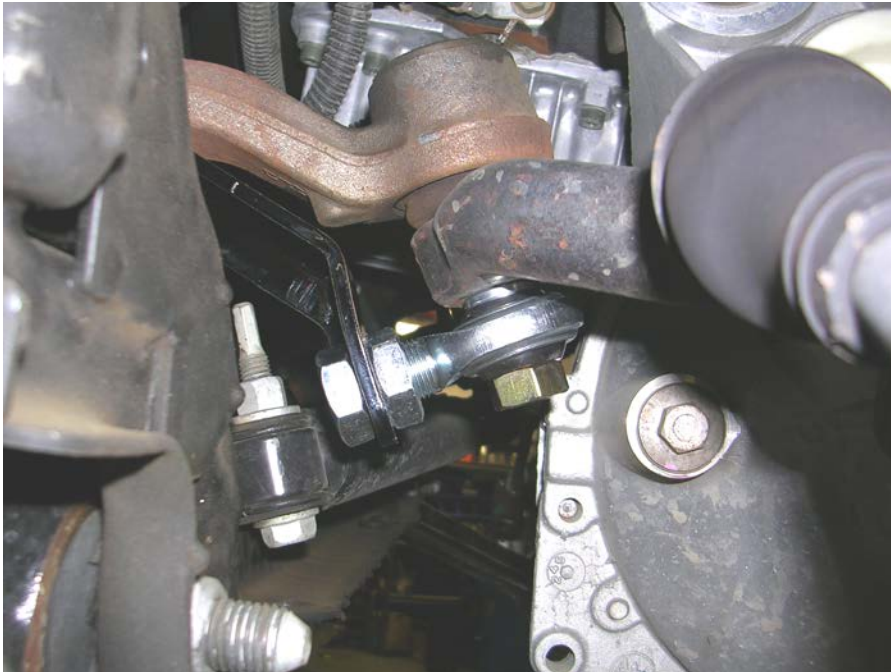
Figure 5: pitman arm bracket installed