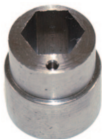
Replacement hex bushing for Chevy sets Part #P9005

Sprockets are machined from premium billet steel on our state-of-the-art CNC equipment. Both sprockets are then induction hardened and oil-quenched using our in-house multi-stage heat treat process. Our Premium True® Roller chain features superior strength with full roller action. Side plates are cut and shaved from high strength steel and heat-treated for maximum fatigue resistance. The .250" rollers are "cold rolled" and hardened to exacting standards increasing load and RPM capabilities. All Hex-A-Just® sets are hand-matched at the Cloyes facility to qualify center distance and control run-out. An additional feature on Chevrolet applications is the Cloyes' patented "cheater" sprocket tooth profile that provides exacting center distance and improved load distribution.