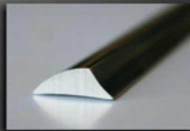
ETK-1 EXT-4, EXT-6, EXT-8