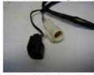
Heated / Electric