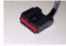
Heated / Electric