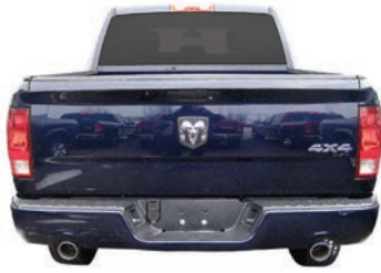
Ram 1500, 2500, 3500