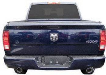
Ram 1500, 2500, 3500