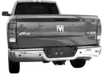
Dodge Ram Pickup