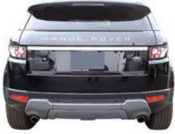
Range Rover Evoque