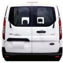
Ford Transit Connect