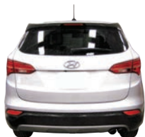
Hyundai Santa Fe Sport