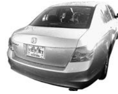
Honda Accord 4 Door Sedan Honda Accord Sedan