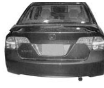
Honda Civic 4 Door