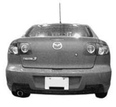
Mazda 3 (All Models)