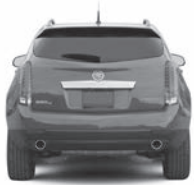
Cadillac SRX w/ Tow Package ONLY