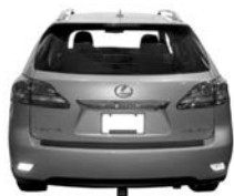
Lexus RX 350 and RX 450h