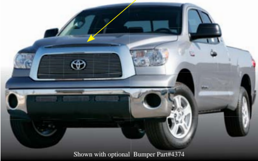
Shown with optional Bumper Part#4374