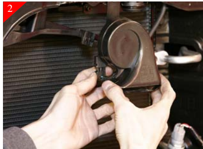
Remove both horns by unclipping the wiring harness and then remove the stock bolt holding in place. This will allow you more room to work.