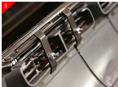
Tighten bolts using an allen wrench and ratchet to fasten.