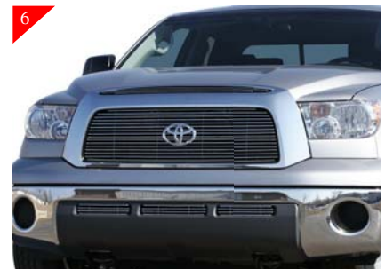
Repeat for remaining grilles.