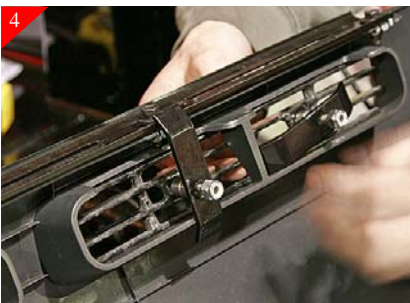
Rotate the brackets sideways and place billet grille into opening and center. Reaching on the backside of the bumper rotate the brackets around so that they catch the top of metal rail and bottom of plastic bumper opening as shown.