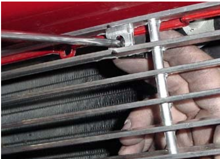
Step 4-Carefully insert and center the billet grille into the bumper opening and set the grille back against the small bumper lip and tighten the clamps as shown.

NOTE: Please adjust horizontal blades if irregular. This is the result of shipping and handling outside of Carriage Work's control.