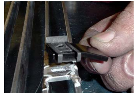
Step 3-Loosely attach the mounting clamps as shown to the billet grille .