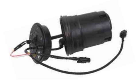
5D-9011L - High Demand! 2012-14 Volkswagen Passat