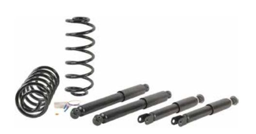
4J-0005K - High Demand! 2000-06 General Motors Trucks

Convert air suspension systems to a cost-effective coil spring solution.