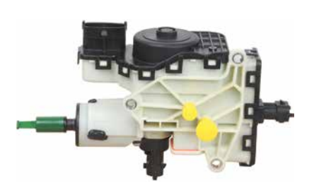
5D-1000 - High Demand! 2010-16 Chevrolet/GMC 6.6L Trucks

Plug-and-play design makes installation a snap!