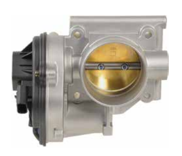
6E-6008 - High Demand! 2005-07 Ford/Mercury Vehicles