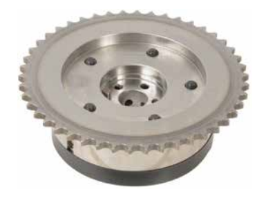
7V-1000P - High Demand! 2006-17 Buick/Chevrolet/GMC/Pontiac/Saturn