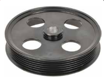
3P-35133 - High Demand! 2001-07 Chrysler, Dodge