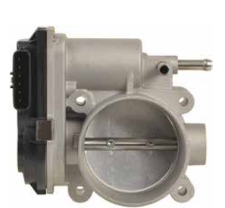
6E-0012 - High Demand! 2004-10 Infiniti Trucks; 2004-17 Nissan Trucks