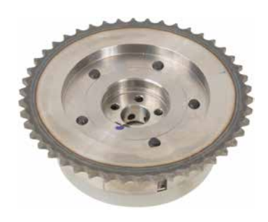
7V-1005P - High Demand! 2006-16 Buick/Chevrolet/GMC/Pontiac/Saturn