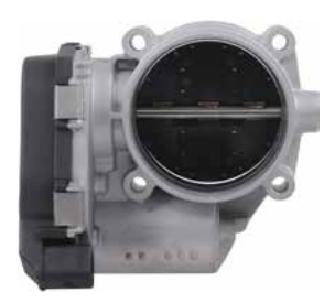
67-4012 - Available Only at CARDONE! 2010-16 Audi S5/S4 V6 3.0L