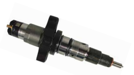
2J-301 - High Demand! 2003-04 Dodge Ram 2500/3500 5.9L Pickups