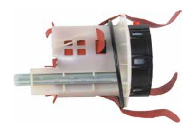
5D-3000 - High Demand! 2010-12 Dodge Ram 2500, 3500, 4500HD, 5500HD