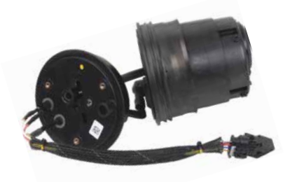
5D-9007L - High Demand! 2015-16 Mercedes Trucks