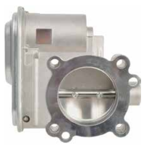
6E-7002 - High Demand! 2007-17 Jeep Trucks; Dodge/Chrysler 2.4 L Vehicles