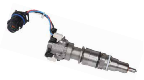
2J-201 - High Demand! 2004-09 International Medium Duty Trucks/ Ford Powerstroke & Medium Duty Trucks, 6.0L