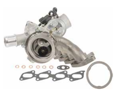
2N-115 - High Demand! 2011-16 GM vehicles