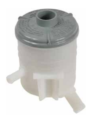
3R-216 - High Demand! 2001-05 Acura, Honda

Matched O.E. design, includes reservoir cap.