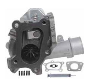
2T-750 - High Demand! 2007-11 Mazda CX-7, 2.3L