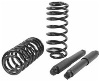
4J-1004K 2007-17 Ford/Lincoln Trucks - Rear