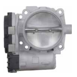
67-5006 - Available Only at CARDONE! 2013-15 Mercedes E350 V6 3.5L