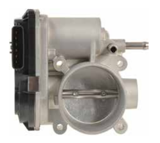
6E-0014 - High Demand! 2007-17 Nissan Vehicles