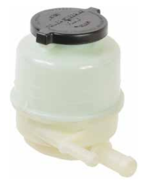
3R-102 - High Demand! 2002-12 Lexus, Toyota