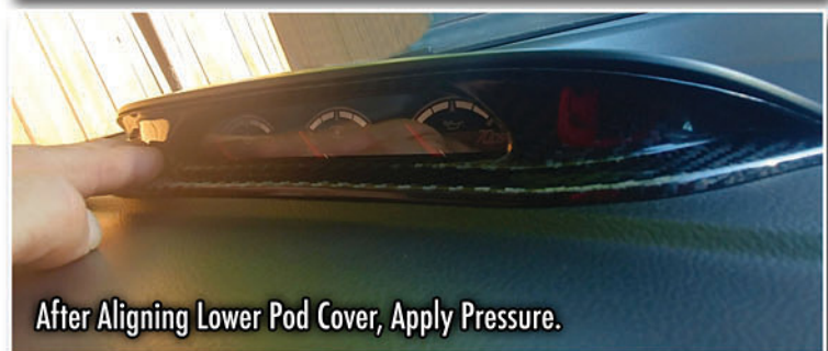
After Aligning Lower Pod Cover, Apply Pressure.