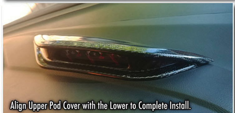
Align Upper Pod Cover with the Lower to Complete Install.