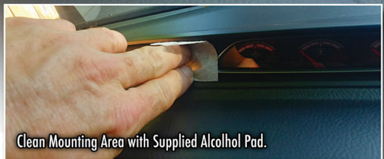
Clean Mounting Area with Supplied Alcohol Pad.

Features: Carbon Fiber 2x2 Carbon Weave High-Gloss Finish 3K with UV Protection Precise Fitment Easy Install