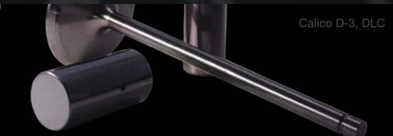
Calico D-3, DLC

These Diamond Like Carbon (DLC) coatings are a dense, metastable form of hydrogenated amorphous carbon containing significant SP3 bonding. The process of bonding carbon and hydrogen confers valuable 'diamond-like' properties such as mechanical hardness, low friction, optical transparency and chemical inertness.