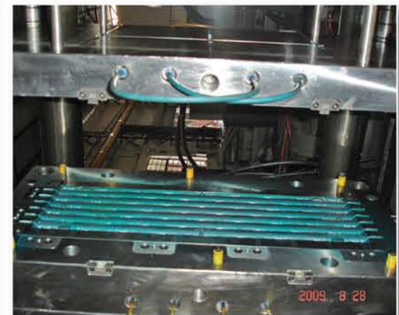
It takes a lot of tooling and manufacturing operations to build the Caliber V-Front ramp shield. Here the ramp tread is formed in a die set. The female cavity of the mold is below, a male form above, and the plastic material fills the void between when the mold is shut by the press holding it.

Learn more about trailer hitches and towing we have.