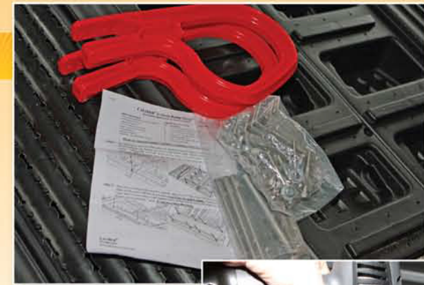
The V-Shield came in a box delivered by UPS, and inside were all the parts and a handy set of instructions.

Installing the Caliber V-Front Ramp Shield means no more wrestling with ramps and excellent protection for whatever we are hauling. We also appreciate its durability: it won't dent like thin aluminum or become stone pecked, and we can hose it down or haul it in bad weather without worrying about rust or corrosion. As a bonus it also comes with Caliber's Lifetime warranty that covers their entire product line. Overall, the V-Front Ramp Shield is a well thought out product that delivers on its promise at the very competitive list price. The Caliber V-Front Ramp Shield serves our need for protection and for ramps. We like it!