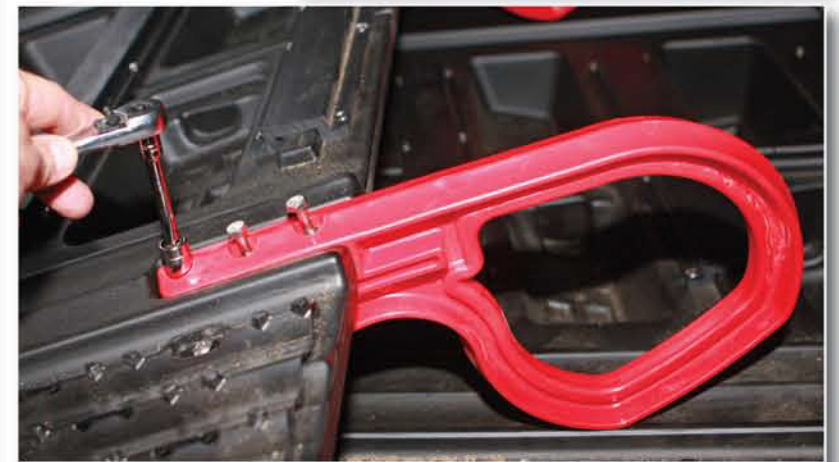
Assembling the V-Front Ramp kit was easy and fun! A few simple tools are all that is required but it's easier to have a buddy when mounting on the trailer. Total time for our kit was about 45 minutes.