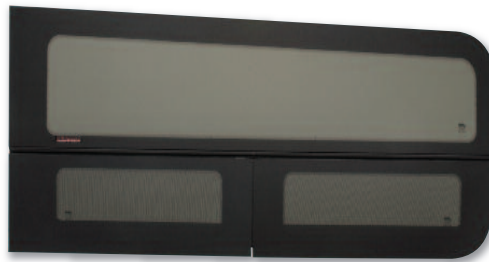
Left Quarter Panel