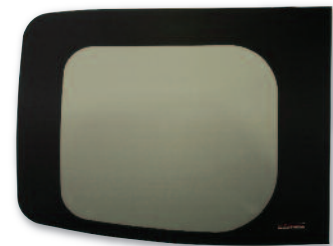
Left Rear Door Window