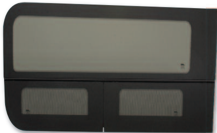
Left Forward Panel