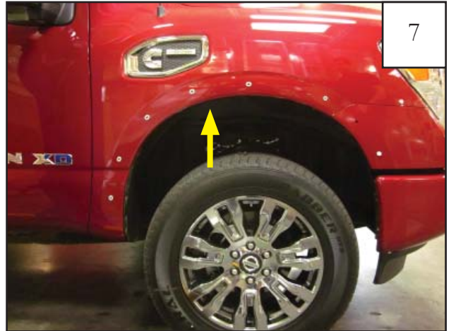
Using a #2 Phillips Screwdriver, remove factory screw from wheel well.