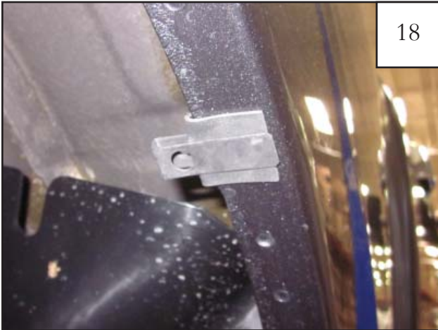
18 Install supplied long clips (CL1-0009) over the foam tabs.