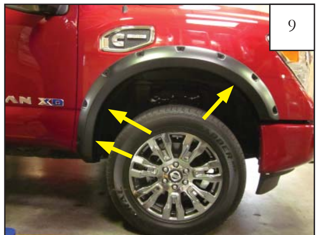
Position flare on fender. Line up holes in flare with the factory holes and start the two 3 supplied screws (SW1-0049) where indicated in picture. Do not fully tighten screws.