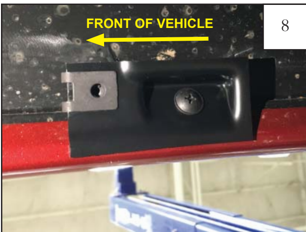
Use factory screw to install inner bracket in wheel well where shown.