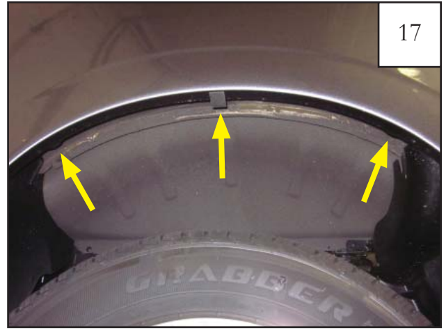
17 Install a foam tab (MT1-0034) over 3 top center metal tabs in the wheel well