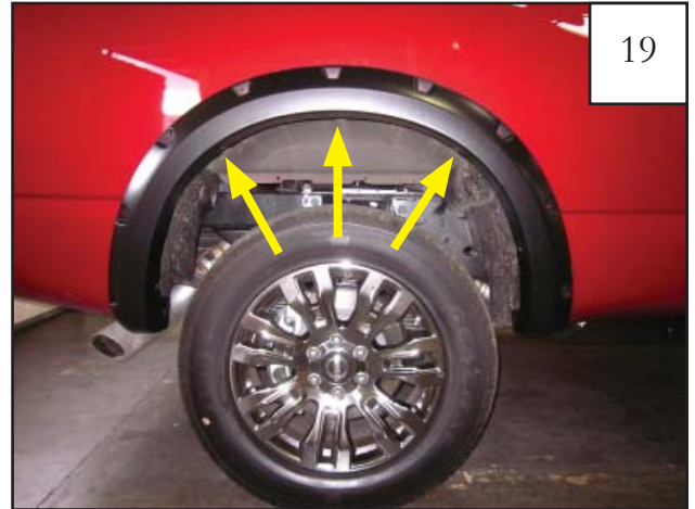
19 Position flare on rear fender and install 3 supplied screws (SW1-0058) through flare and into the clip holes.