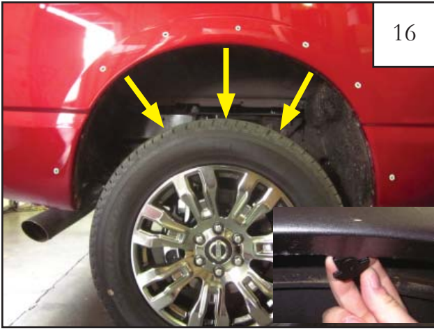
16 After removing the Factory flare, remove 3 factory installed clips.