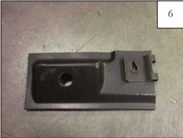
Install supplied clip (CL1-0022) on end of inner bracket.