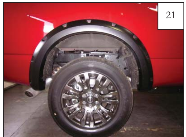
21 Installation complete.