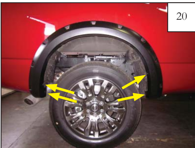
20 Install 4 supplied screws (SW1-0049) through holes in flare and into the existing factory holes.