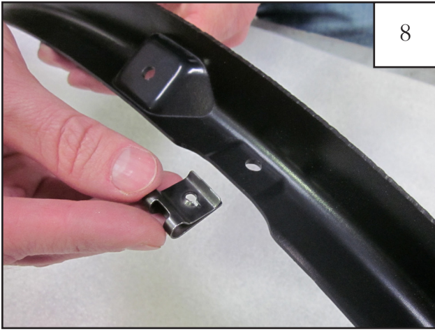
Verify presence of U-clip on inner brackets.