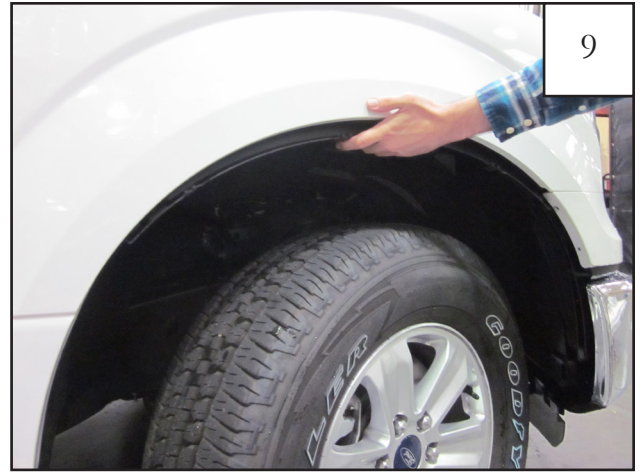
Line up the holes in the inner piece with the three uppermost factory holes. NOTE: Both inner brackets are universal.