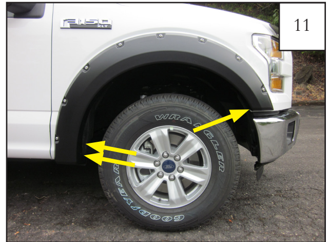
Hold flare to fender, re-install three factory screws removed in Step 4 using sockets and wrench.