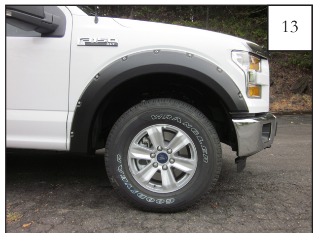
Completed front flare installation.