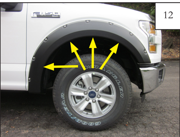
Position flare on fender, pressing inward on the flare, line up the flare mounting holes with the mounting clips on the inner piece. Install four Phillips Truss Screws (SW1-0058) through the flare and into the clips on the inner piece. Install and tighten.