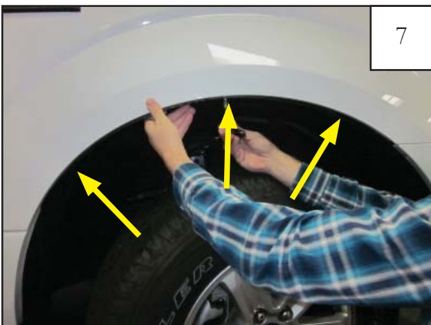
Using a 7/32" socket wrench, reinstall the factory screws through the inner piece.