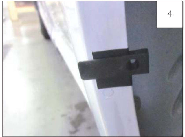
Install a Clip (CL1-0009) over the Tab (MT1-0034) placed in Step 3.