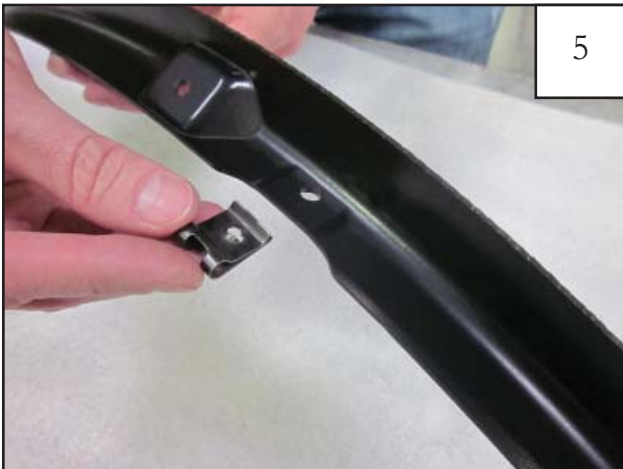
Attach 3 "U"clips (CL1-0022) to the inner bracket as shown.