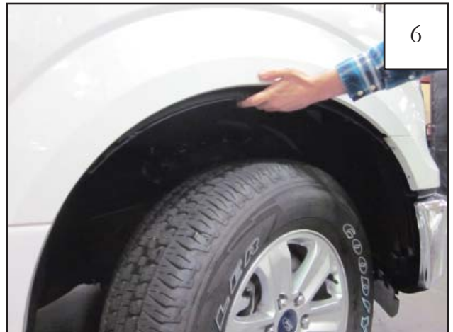
Line up the holes in the inner piece with the three uppermost factory holes. NOTE: Driver's side inner piece is marked with an "LR" and passenger's side inner piece is marked with an "RR".