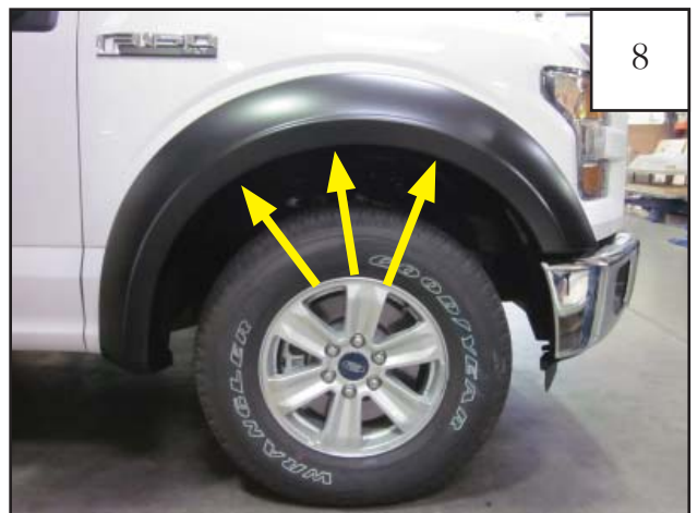
Position flare on fender, pressing inward on the flare, line up the flare mounting holes with the mounting clips on the inner piece. Install 3 Phillips Truss Screws (SW1-0058) through the flare and into the clips on the inner piece. Do not tighten. (3 locations)