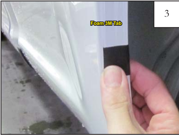
Wrap a Foam Tab (MT1-0034) around the wheel well sheet metal, centered over the mark made in Step 2.