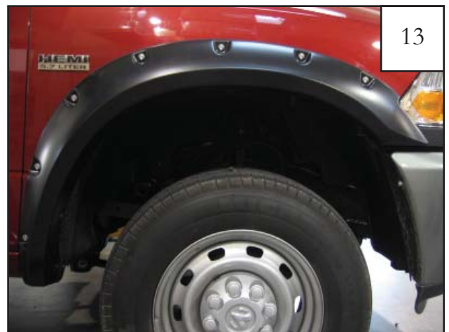
13 Completed front flare installation.