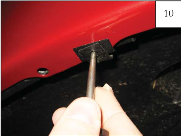
10 Using an awl or similar pointed tool, poke a hole through Tab (MT1-0014) using the Clip (CL1-0022) hole as a guide.