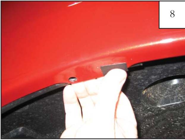
8 Install Tab (MT1-0014) over existing factory hole. There are two holes at the top center location. Refer to step 7 for proper hole for installation.