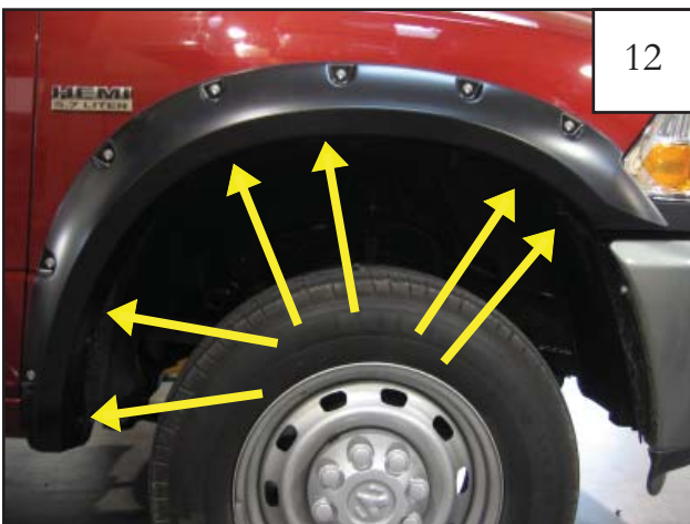
12 Press firmly on flare and tighten all screws.