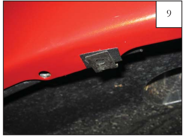
9 Install Clip (CL1-0022) over Tab (MT1-0014).