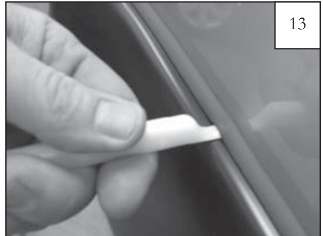
Using flat end of supplied Edge Trim Tool, seat edge trim against flare by inserting straight end between edge trim and flare at one end. Next, slide around entire edge to the other end.