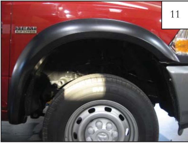
Completed front flare installation.