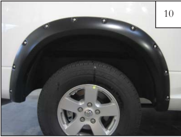
Completed rear flare installation.