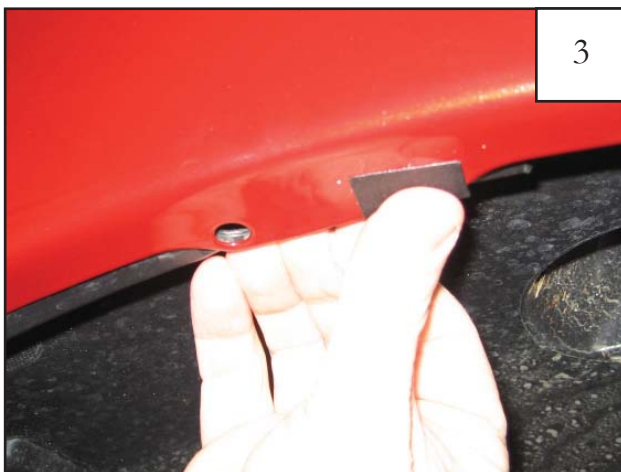
Install plastic tab over existing factory hole.