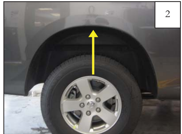
Install plastic tab and speed clip in this location. See step 3, 4 & 5.