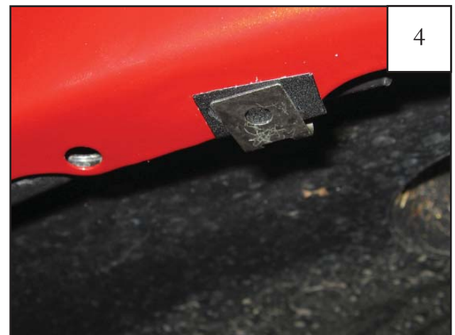
Install speed clip over plastic tab.