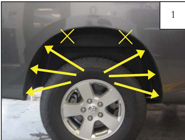
Remove six factory installed screws using an 8 mm socket wrench. Keep screws for installation of the rear flare. X's indicate a factory screw that will not be removed.