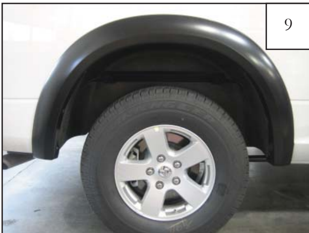
Completed rear flare installation.