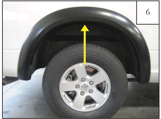
Start #8 pan-head screw using a Phillips screwdriver. Do not tighten.