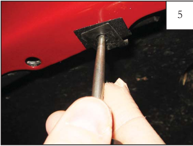
Using an awl or similar pointed tool, poke a hole through plastic tab using the speed clip hole as a guide.