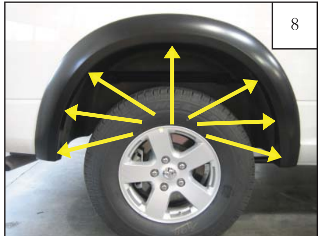
Press firmly on flare and tighten all screws.