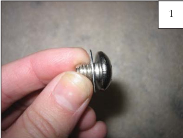
Put a Washer (WA1-0012) on each Bolt (SW1-0059).