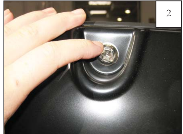
Put each Bolt/Washer combination through a pocket hole in the flare, Bolt head and Washer on the outside.