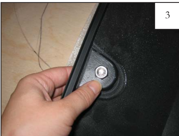
Place a Nut (NU1-0019) over the end of each Bolt and tighten, using a 1/2" wrench for the Nut and the supplied Torx Bit (SW1-0052) for the Bolt. Repeat for remaining pockets.