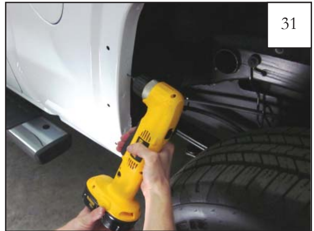
Using a 3/32" drill bit, drill pilot holes through sheet metal at the marks made in Step 30.