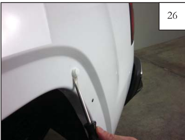
Use a pry tool to remove any remaining factory fasteners that may have stayed on the vehicle during the removal process.