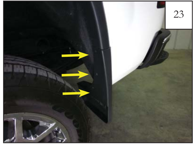
FOR MODELS WITH FACTORY MUDFLAP: Use a Phillips Head Screwdriver to remove 3 factory mud flap fasteners.