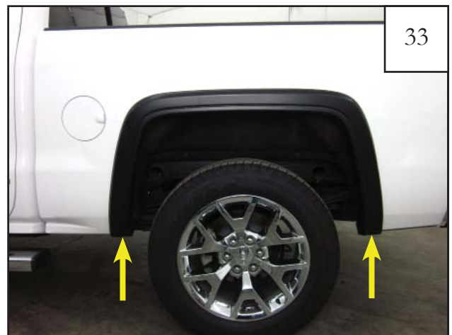
Reinstall the lower 2 factory fasteners removed in step 24 using a 10mm deep socket and wrench.