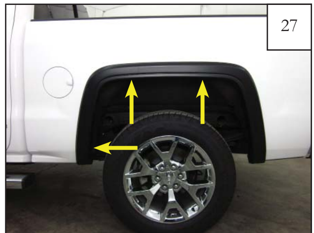
Hold rear flare up to wheel well to confirm fit. While holding flare on vehicle, install supplied screws (SW1-0056) into the 2 upper and 1 lower factory hole locations. Do not fully tighten at this time.