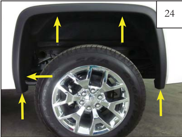
Remove fasteners from factory wheel arch molding using a T-15 Torx Bit for upper and lower wheel well fasteners and a 10mm deep socket and wrench for the lower 2 locations. Save the two lower fasteners for re-installation.