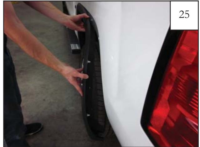
Starting at the lower rear end of the factory flare, firmly grip part and pull to remove from vehicle. Note: You will hear popping sounds as the factory fasteners release from vehicle. This is normal.