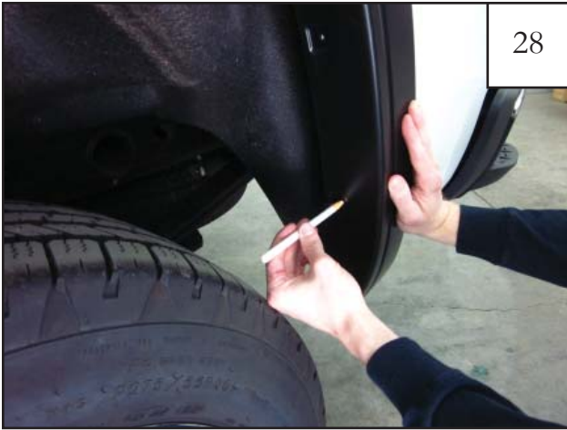
Using a grease pencil or marker, hold flare in place on vehicle and mark hole locations for drilling (3 places).