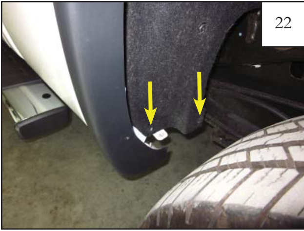
Re-install two factory screws into wheel well liner.