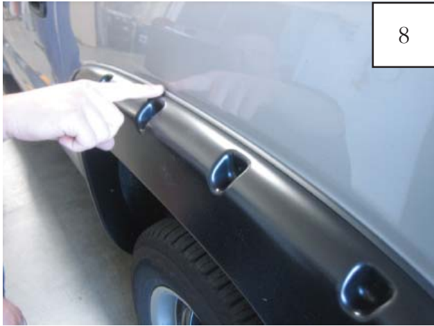
Ensure that the topmost edge of the flare is seated in the groove of the vehicle body.