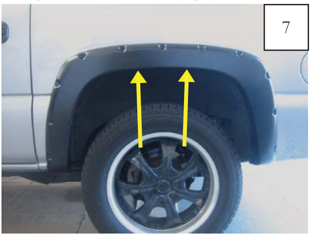
Hold rear flare in place on fender and start the top two Screws (SW1-0056), threading them through the flare, the Clips, and into the factory holes. Do not tighten.