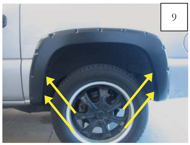
Start the remaining four Screws (SW1-0056). Do not tighten.