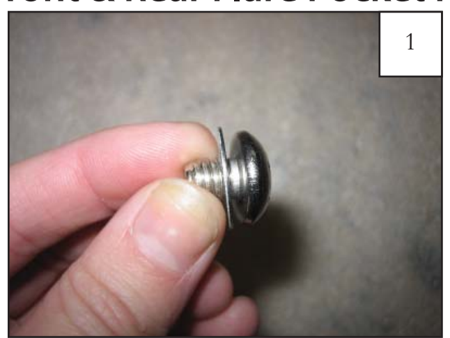
Put a Washer (WA1-0010) on each Bolt (SW1-0059).