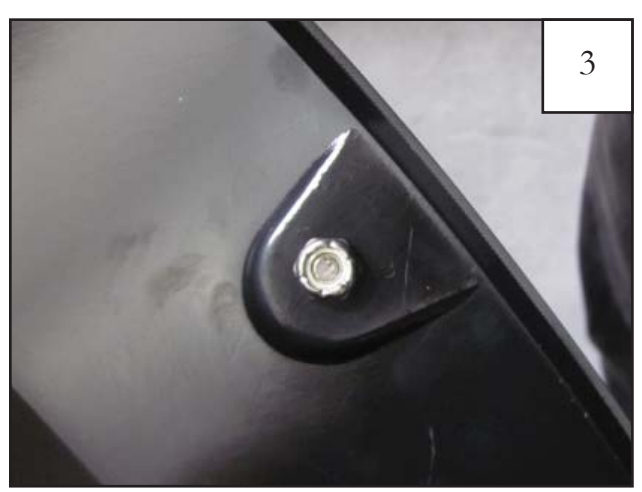
Place a Nut (NU1-0019) over the end of each Bolt and tighten, using a 1/2" wrench for the Nut and the supplied Torx Bit (SW1-0052) for the Bolt. Repeat for remaining pockets.