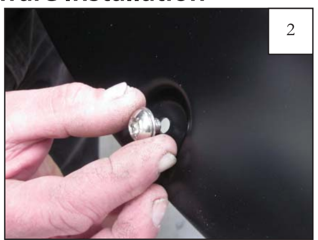
Put each Bolt/Washer combination through a pocket hole in the flare, Bolt head and Washer on the outside.