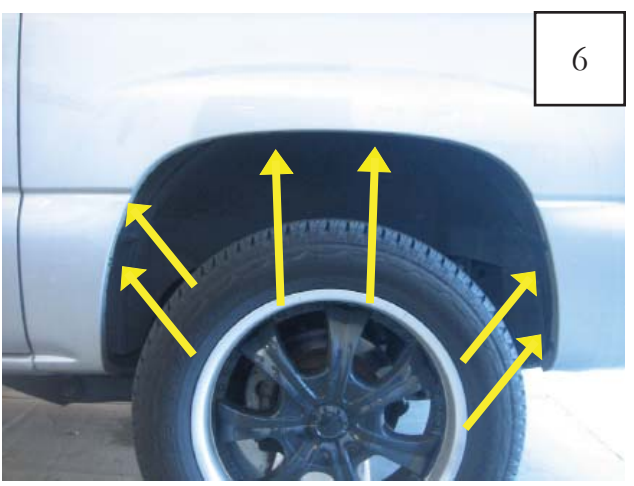
Place Clips (CL1-0022) over the six factory holes that line up with the holes in the fender flare. NOTE: There may be extra factory holes not used for installation.