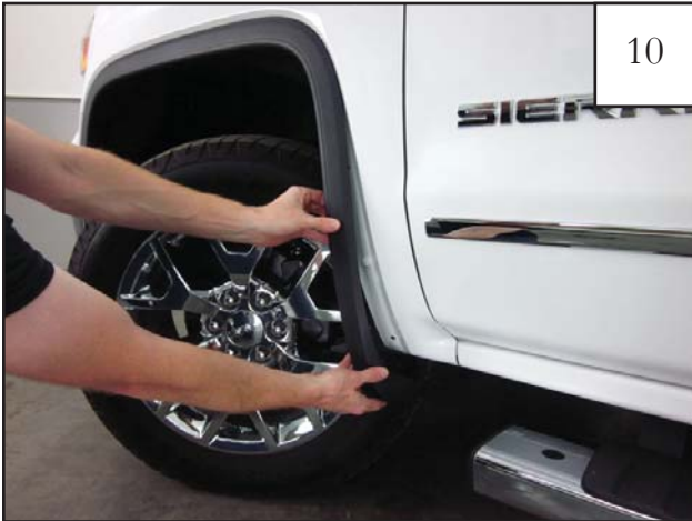
Starting at the lower rear end of the factory flare, firmly grip part and pull to remove from vehicle. Note: You will hear popping sounds as the factory fasteners release from vehicle. This is normal.