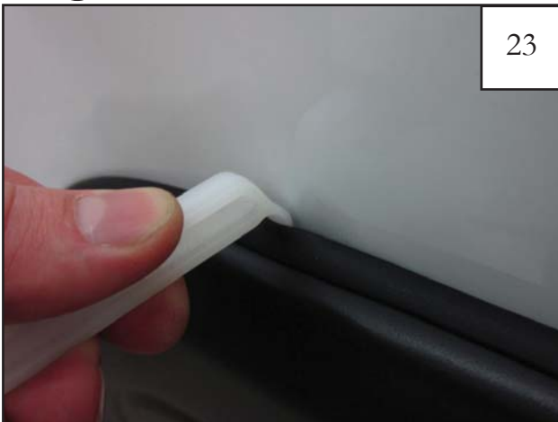
Using supplied Edge Trim Tool (ET1-0002), seat edge trim against vehicle by hooking curved end under edge trim at one end of flare. Next, slide around outer edge of flare to the other end.