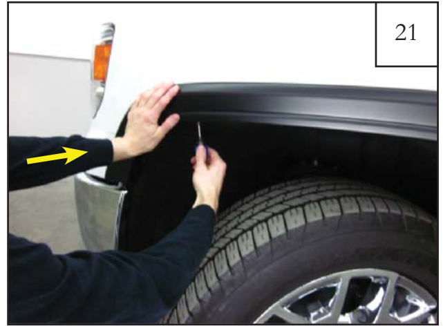
Press flare towards vehicle and fully tighten all remaining fasteners.