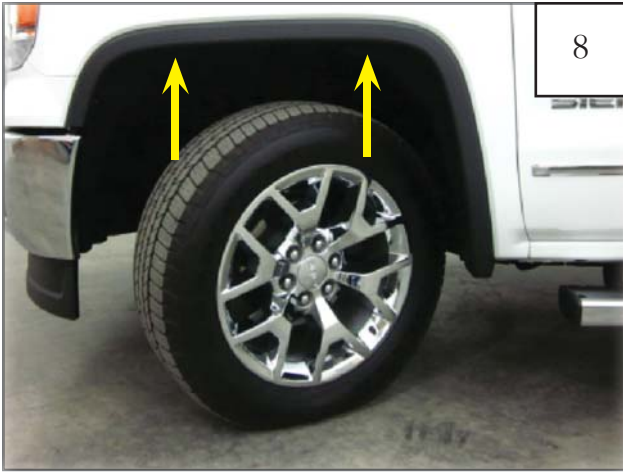
Remove two fasteners along top of factory wheel arch molding using a T-15 Torx bit.