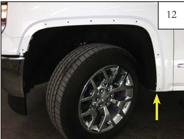
Reinstall factory fastener removed in step 9 using a 1/2" socket and wrench.