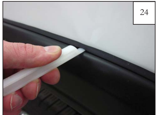
Using flat end of supplied Edge Trim Tool (ET1-0002), seat edge trim against flare by inserting straight end between edge trim and flare at one end. Next, slide around entire edge to the other end.