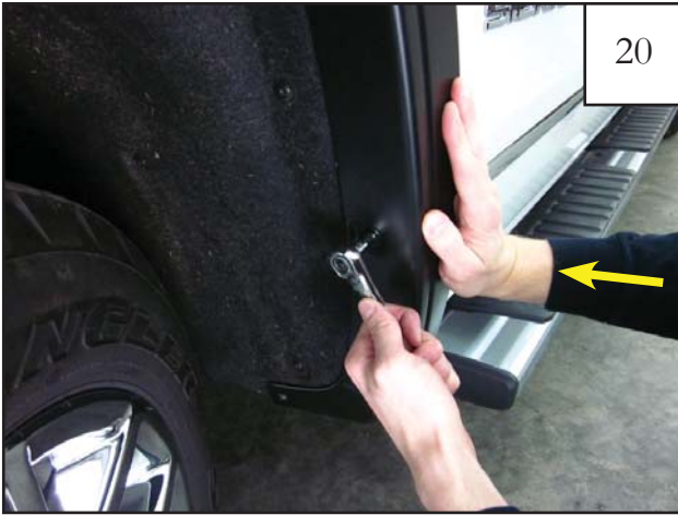
FOR MODELS WITH FACTORY MUDFLAP: Reinstall factory fastener removed from mudflap in step 5. Press flare towards vehicle while fully tightening using a T-30 Torx Bit.