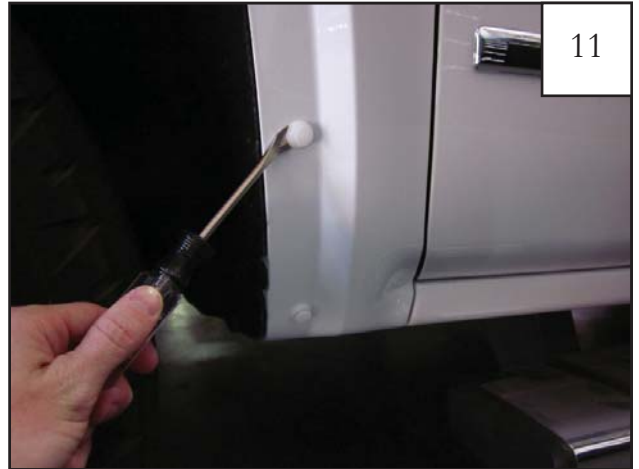
Use a pry tool to remove any remaining factory fasteners that may have stayed on the vehicle during the removal process.