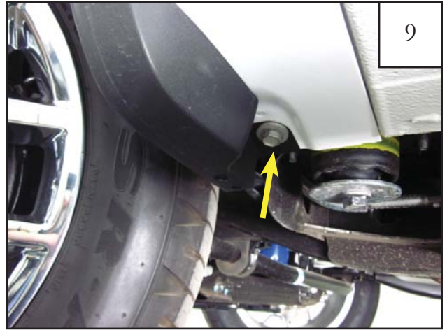
Remove fastener from rear underside of factory wheel arch molding using a 1/2" socket and wrench. Save for reinstallation.