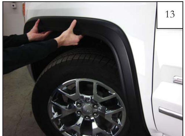
Hold Front Flare up to wheel well to confirm fit. Do not install fasteners at this time.