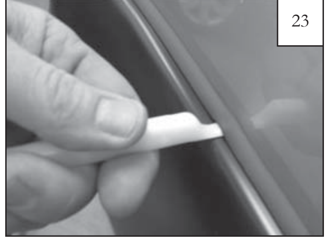
Using flat end of supplied Edge Trim Tool (ET1-0002), seat edge trim against flare by inserting straight end between edge trim and flare at one end. Next, slide around entire edge to the other end.