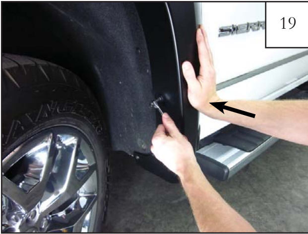
FOR MODELS WITH FACTORY MUDFLAP: Reinstall factory fastener removed from mudflap in step 5. Press flare towards vehicle while fully tightening using a T-30 Torx Bit.