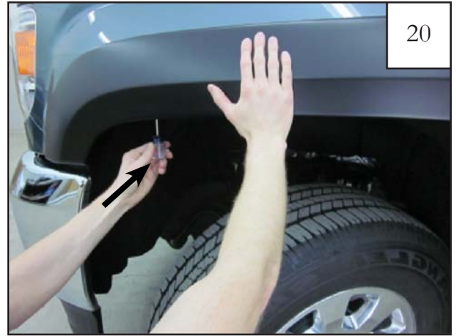
Press flare towards vehicle and fully tighten all remaining fasteners.