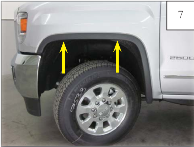
Remove two fasteners along top of factory wheel arch molding using a T-15 Torx bit.