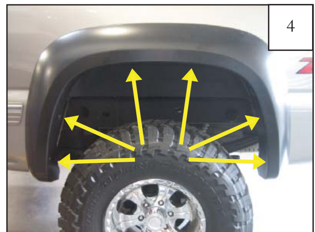
Install six tuflocks using a #2 stubby screwdriver.