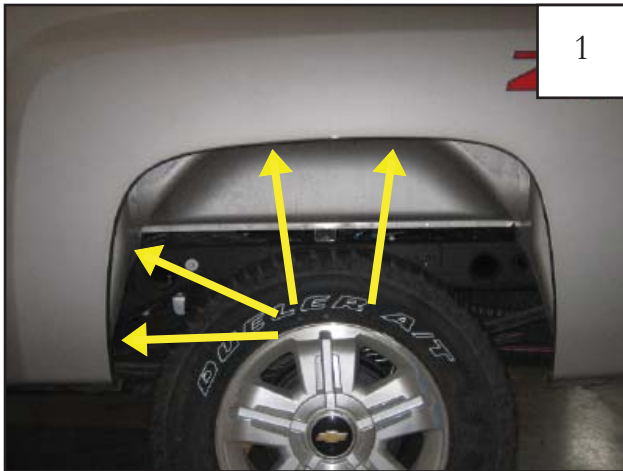
Remove four factory fasteners with a pry tool.