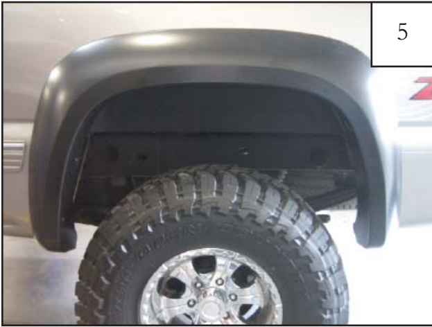
Completed rear flare installation.