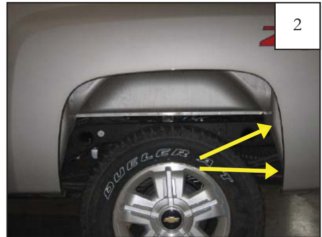
Remove two factory screws with a #2 stubby screwdriver.