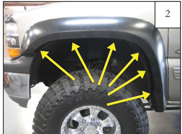
Install six tuflocks using a #2 stubby screwdriver.