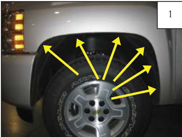
Remove six factory fasteners with a pry tool.