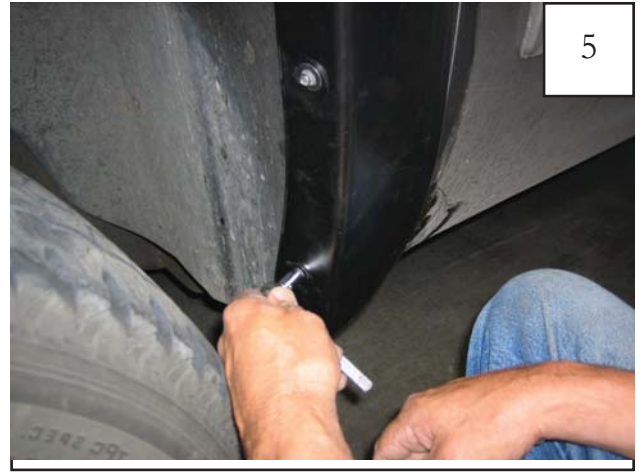
Position flare on fender and reinstall six factory screws removed in Step 4. If needed, use an awl to locate holes.