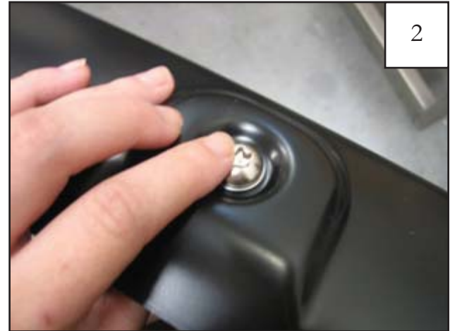
Put each Bolt through a pocket hole in the flare, bolt head on the outside.