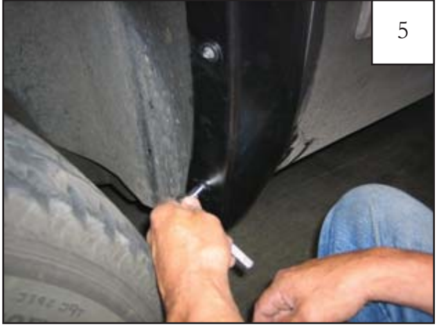
Position flare on fender and reinstall the four factory screws removed in Step 4.