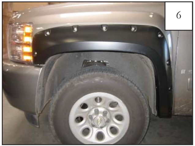
Verify fit and tighten all screws.