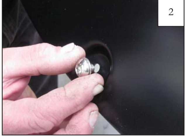
Put each Bolt/Washer combination through a pocket hole in the flare, Bolt head and Washer on the outside.