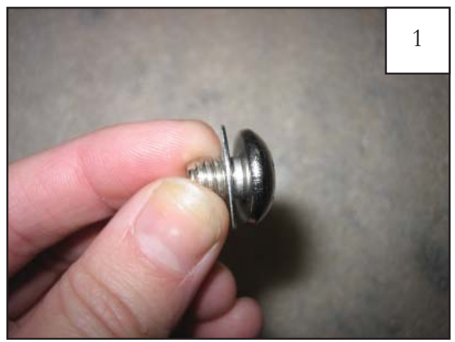
Put a Washer (WA1-0012) on each Bolt (SW1-0059).