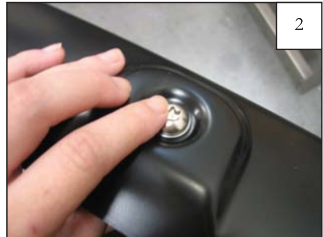
Put each Bolt through a pocket hole in the flare, bolt head on the outside.