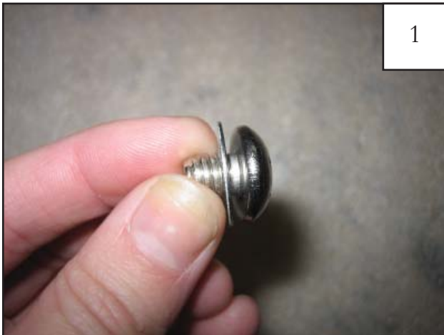
Put a Washer (WA1-0012) on each Bolt (SW1-0059).