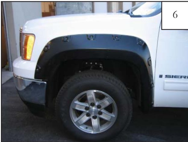
Completed front flare installation.