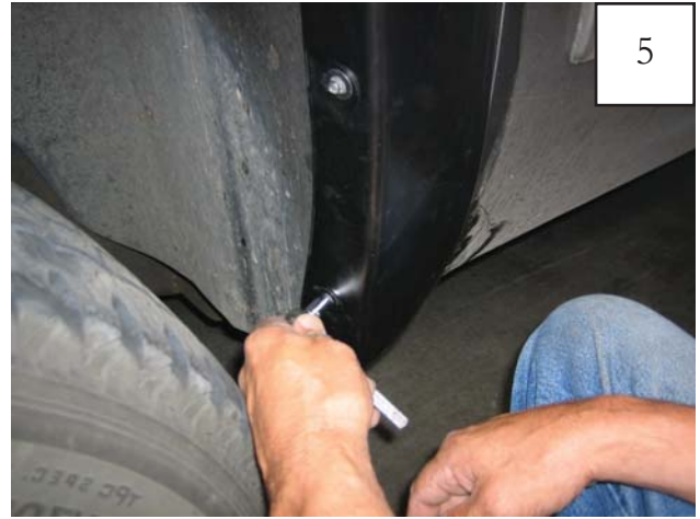
Position flare on fender and reinstall six factory screws removed in Step 4. If needed, use an awl to locate holes.