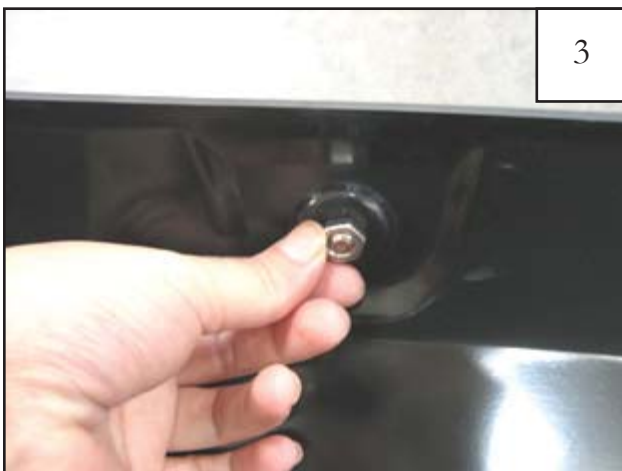
Place a Nut (NU1-0019) over the end of each Bolt and tighten, using a 1/2" wrench for the Nut and the supplied Torx Bit (SW1-0052) for the Bolt. Repeat for remaining pockets.