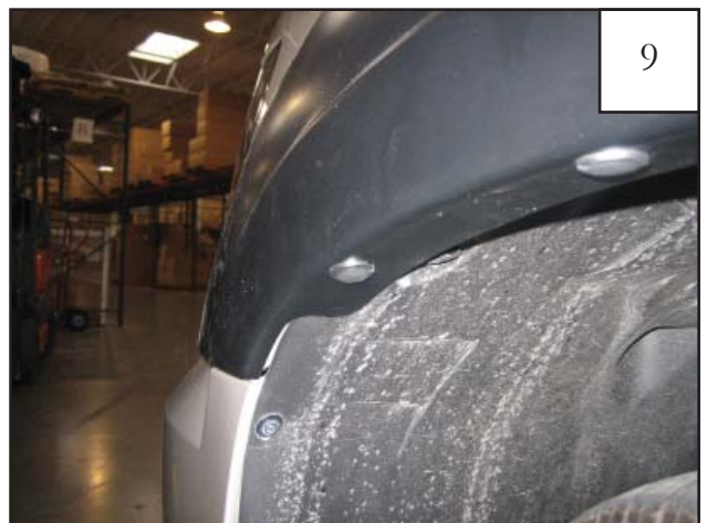
Using hole located in forward portion of flare as a guide, drill through the splash shield with a 5/16" bit. Holes in flare and splash shield should align with factory hole located in fender.